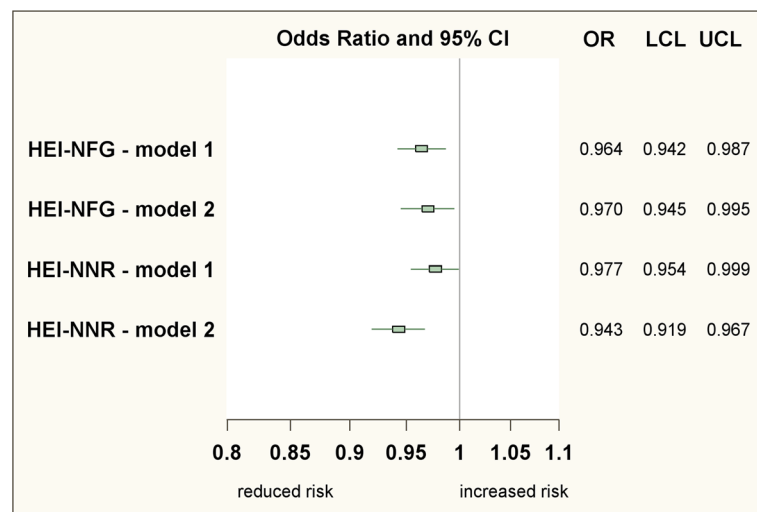
Figure 2 Adherence to Norwegian food guidelines or NNR and risk of substantial postpartum weight retention. Abbreviations: CI Confidence Interval, HEI Healthy Eating Index, LCL Lower Confidence Limit, NFG Norwegian Food Guidelines, NNR Nordic Nutrition Recommendations, OR Odds ratio, UCL Upper Confidence Limit. Substantial postpartum weight retention is defined as having gained at least 5% to the pre-pregnancy weight. Odds ratios of having substantial postpartum weight retention are modelled per standard deviation-increment of each HEI score. Logistic regression model 1: adjusted for maternal age, maternal education, household income, marital status, pre-pregnancy BMI, parity, weight of the child at birth, breastfeeding duration up to 6 months postpartum, total energy intake, exercise, smoking, and alcohol intake during pregnancy. Logistic regression model 2: additionally adjusted for gestational weight gain.

on maternal weight development after pregnancy instead of studying dietary patterns. Martins et al. [14], for instance, found that an increased intake of saturated fat or processed foods during pregnancy was connected to an increment in postpartum weight retention. However, this analysis considered only a few covariates. In fact, these associations were mainly explained by an increased total energy intake, as the observed effect of saturated fat and processed foods was eliminated after further adjustment for energy intake. Other studies only considered the postpartum period, thereby disregarding the effect of diet during pregnancy. Such studies found that an increased intake of trans fat [32] or junk food (i.e. sweetened beverages, French fries and chips, fast food) [33] after birth is associated with increased postpartum weight retention. In addition, there is one recent longitudinal study showing that diet quality postpartum, assessed by the adherence to either a Mediterranean style diet or the Dietary guidelines for Americans, was not associated with postpartum weight retention [34]. In contrast, Stendell-Hollis et al. found in an interventional trial that adherence to either a Mediterranean style diet or the US Department of Agriculture (USDA) My Pyramid diet supported the promotion of postpartum weight loss [35] but this study only covers the lactation period. Hence, it is not clear whether this is transferable to the effect of diet during pregnancy on postpartum weight.