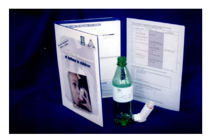
Figure 1 Support materials left behind for practitioner use.

Private healthcare in Mitchells Plain is usually provided by solo doctors without nurse support operating from storefront practices in the community (Figure 1). There is no formal registration list or roster system, and patients may move between several sources of primary care, including public sector clinics. Payment for private care provided to adults employed in the formal economy and their families is usually made by their employer-based