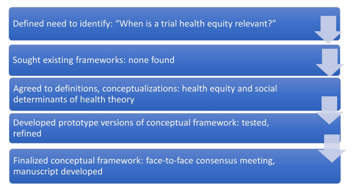
Figure 1 Description of the conceptual framework development process.

Gender/Sex, Religion, Education, Socioeconomic status, and S ocial capital. 18-20 Due to advances in thinking about causal associations/linkages between degree of control in the living environment and socioeconomic inequities in health-related outcomes, 'Control' was included with 'Social Capital'.<sup>21</sup> PROGRESS-'Plus' represents additional context-specific personal or setting characteristics that may be associated with health inequities and that are relevant to our study: (1) individual characteristics, for example, disability, age, sexual orientation; (2) features of relationships with effects on power differentials that impact personal autonomy, for example, children who suffer passive smoking because their parents smoke in the home and (3) time-dependent transitions, for example, migration and/or refugee status.<sup>22 23</sup> The degree to which PROGRESS-Plus characteristics are associated with health inequity depends on time, place and interaction between the different dimensions.