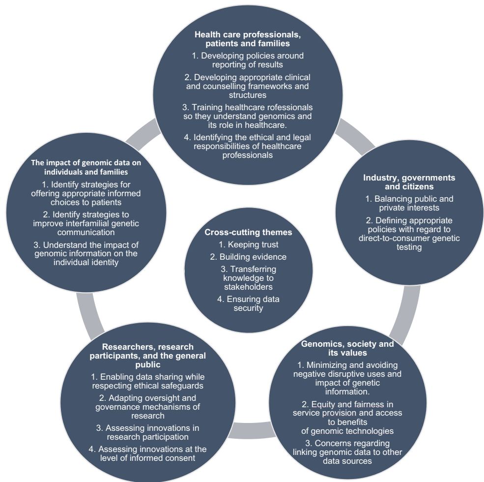
Fig. 1 Five salient/key relationships in the realm of genetics and genomics and the central cross-cutting themes

need further elaboration as well as potential harmonization, especially with regard to the pertinent responsibilities of involved parties (Vears et al. 2017a, b).