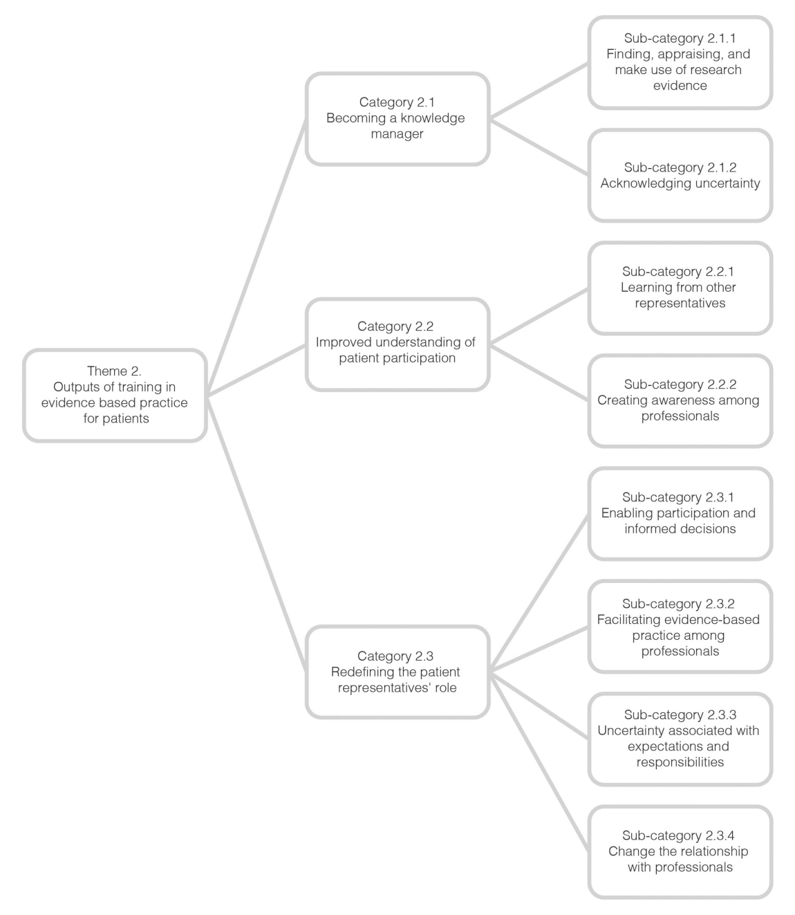
FIGURE 2 Flowchart—theme 2

"My motivation was to find research evidence, simply to learn how to best navigate in all what is out there. I think being able to do this will be two very important tools for me in the future. It has been really useful, and I am so grateful."