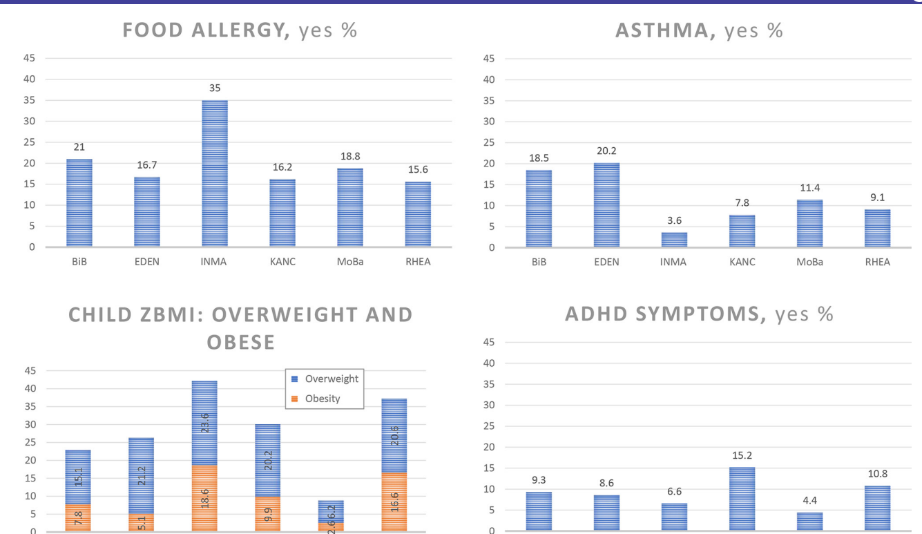
Figure 2 Prevalence of children with food allergy, asthma, overweight/obesity and ADHD symptoms in the HELIX subcohort at 6–11 years. BiB, Born in Bradford; EDEN, Étude des Déterminants pré et postnatals du développement et de la santé de l'Enfant; HELIX, Human Early Life Exposome; INMA, INfancia y Medio Ambiente; KANC, Kaunus cohort; MoBa, Norwegian Mother and Child Cohort Study; zBMI, age standardized z-score for body mass index.