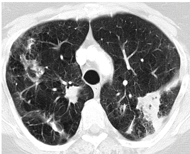
Figure 1 CT thorax of a patient with severe COPD with emphysema. Cavernous and fibrotic changes and infiltrates are seen. There was repeated growth of M. intracellulare in bronchial specimens.