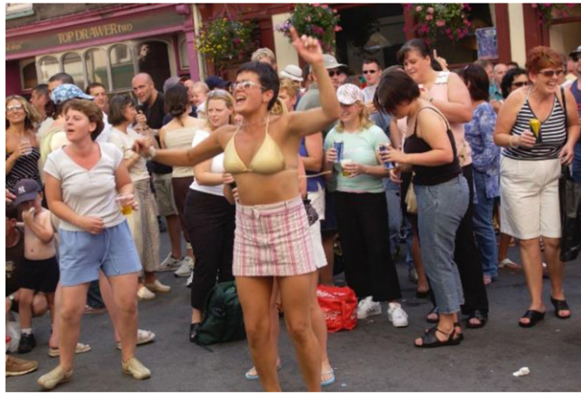
Figure 1. Photo illustrating public intoxication.

the focus groups had 5–7 participants. Due to cancellations, two groups had three participants, but the dynamics in these groups did not differ from the rest (see also Simonen et al., 2017). All groups were gender mixed, except the all-female adult groups in Finland.