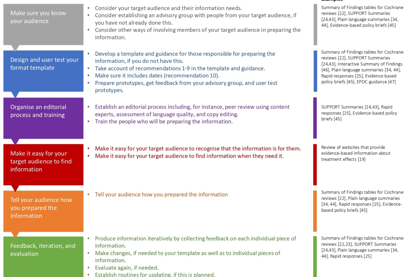
Figure 1 Flow chart outlining a process for producing evidence-based information about the effects of interventions

piece of information from people in your target audience; to make changes if needed (to your template as well as to individual pieces of information); and to evaluate again, if needed. It also includes establishing routines for updating the information that you prepare, if this is planned.