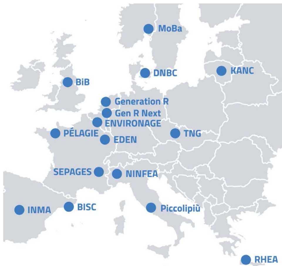
Figure 2. Cohorts participating in ATHLETE. BiSC indicates Barcelona Life Study Cohort; DNBC, Danish National Birth Cohort; EDEN, Etude des Determinants pre et postnataux du developpement et de la sante de l'Enfant; ENVIRONAGE, environmental influence on early ageing; INMA, Infancia y Medio Ambiente; KANC, Kaunas Cohort; MoBa, Norwegian Mother and Child Cohort Study; NINFEA, Nascita e Infanzia: gli Effetti dell'Ambiente; PELAGIE, Perturbateurs Endocriniens: Étude Longitudinale sur les Anomalies de la Grossesse, l'Infertilité et l'Enfance; RHEA, Crete Mother Child Cohort; SEPAGES, Suivi de l'Exposition à la Pollution Atmosphérique durant la Grossesse et Effets sur la Santé; TNG, CELSPAC The Next Generation cohort.

recently established, state-of-the-art birth cohorts that are highly suitable for exposome research: Suivi de l'Exposition à la Pollution Atmosphérique durant la Grossesse et Effets sur la Santé (SEPAGES) in France, 59 environmental influence on early ageing (ENVIRONAGE) in Belgium, 60 Generation R Next in the Netherlands, Barcelona Life Study Cohort (BiSC) in Spain ( https://www.projectebisc.org ), Piccolipiù in Italy, 61 and CELSPAC-The Next Generation (TNG) in the Czech Republic. The inclusion of new cohorts is important for (1) their improved sampling strategies for exposure assessment, in particular the collection of many repeated urine samples during pregnancy (BiSC and SEPAGES), personal monitoring (BiSC and SEPAGES), and placenta sampling (BiSC, SEPAGES, ENVIRONAGE) and (2) their cutting-edge outcome assessments, including imaging techniques, to study organ and placenta development (BiSC, Generation R Next). The inclusion of new exposome cohorts also allows the evaluation of new chemicals that are now produced in high volumes but that are not detectable in biosamples collected during pregnancy in older cohorts even 10 years ago (e.g., new bisphenols).