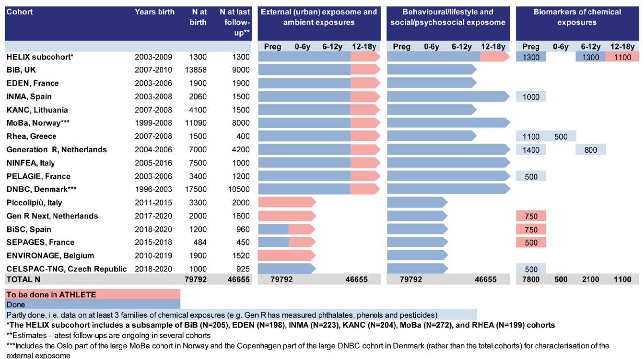
Figure 3. Timeline of available data on exposome domains in the ATHLETE cohorts. BiSC indicates Barcelona Life Study Cohort; CELSPAC-TNG, CELSPAC The Next Generation cohort; DNBC, Danish National Birth Cohort; EDEN, Etude des Determinants pre et postnataux du developpement et de la sante de l'Enfant; ENVIRONAGE, environmental influence on early ageing; HELIX, Human Early Life Exposome; INMA, Infancia y Medio Ambiente; KANC, Kaunas Cohort; MoBa, Norwegian Mother and Child Cohort Study; NINFEA, Nascita e Infanzia: gli Effetti dell'Ambiente; PELAGIE, Perturbateurs Endocriens: Étude Longitudinale sur les Anomalies de la Grossesse, l'Infertilité et l'Enfance; RHEA, Crete Mother Child Cohort; SEPAGES, Suivi de l'Exposition à la Pollution Atmosphérique durant la Grossesse et Effets sur la Santé.

cohort data. Each cohort will harmonize and store their own harmonized data on secure local servers and make the metadata findable through the data catalog.