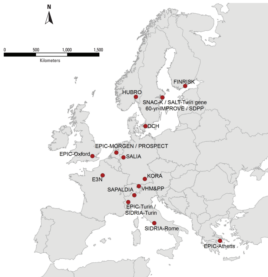
Figure 1. Cohort locations in which elements were measured.

Single-pollutant results. Positive HRs were estimated for almost all exposures, with a statistically significant association for