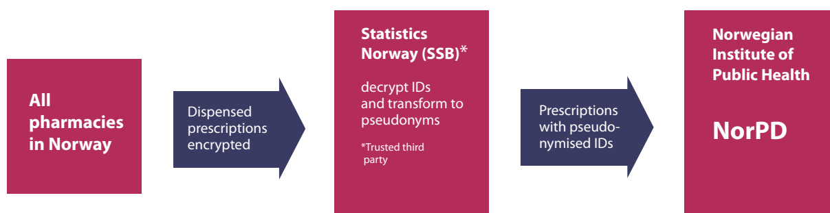
Figure 1.1. Data flow, the Norwegian Prescription Database (NorPD).

Varenummeret er en unik identifikasjon for hver pakning av et legemiddel og muliggjør kobling til andre registre som gir detaljert informasjon om legemidlene.