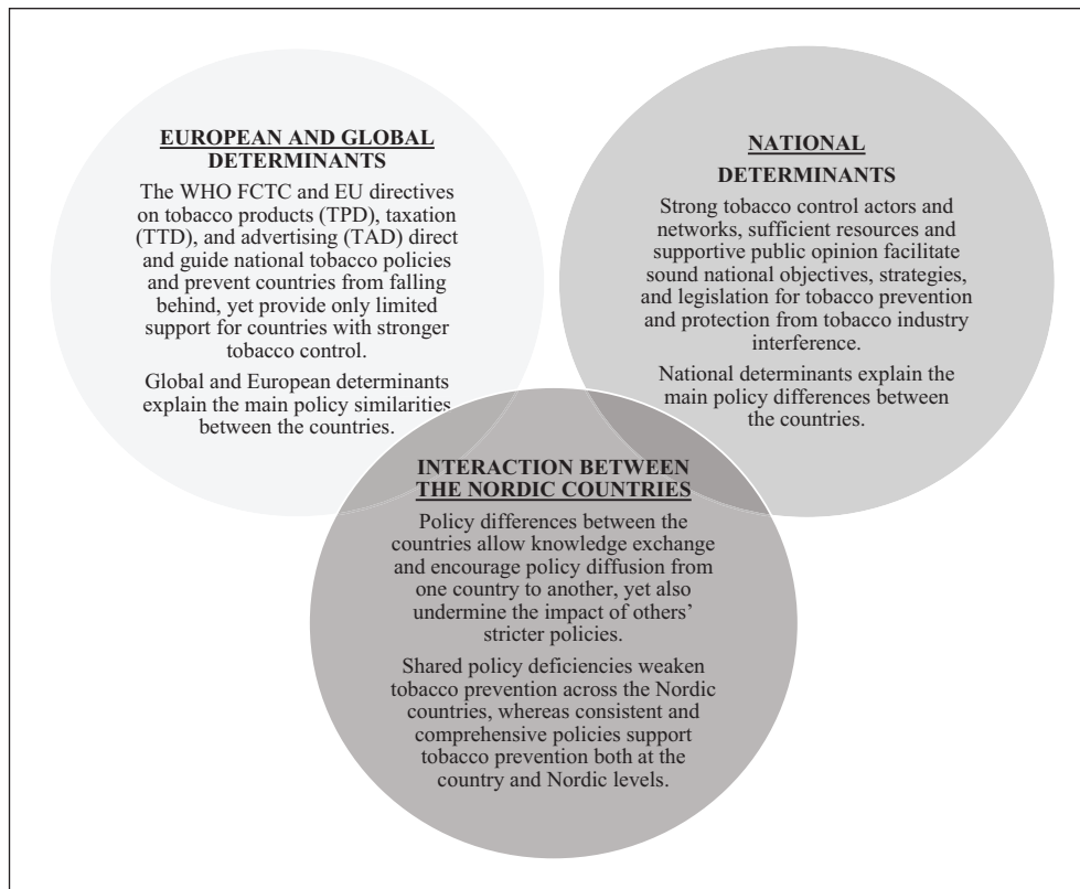
Figure 2. Summary of the global, European, Nordic and national determinants on the adoption and implementation of the preventive tobacco policies in the Nordic countries.