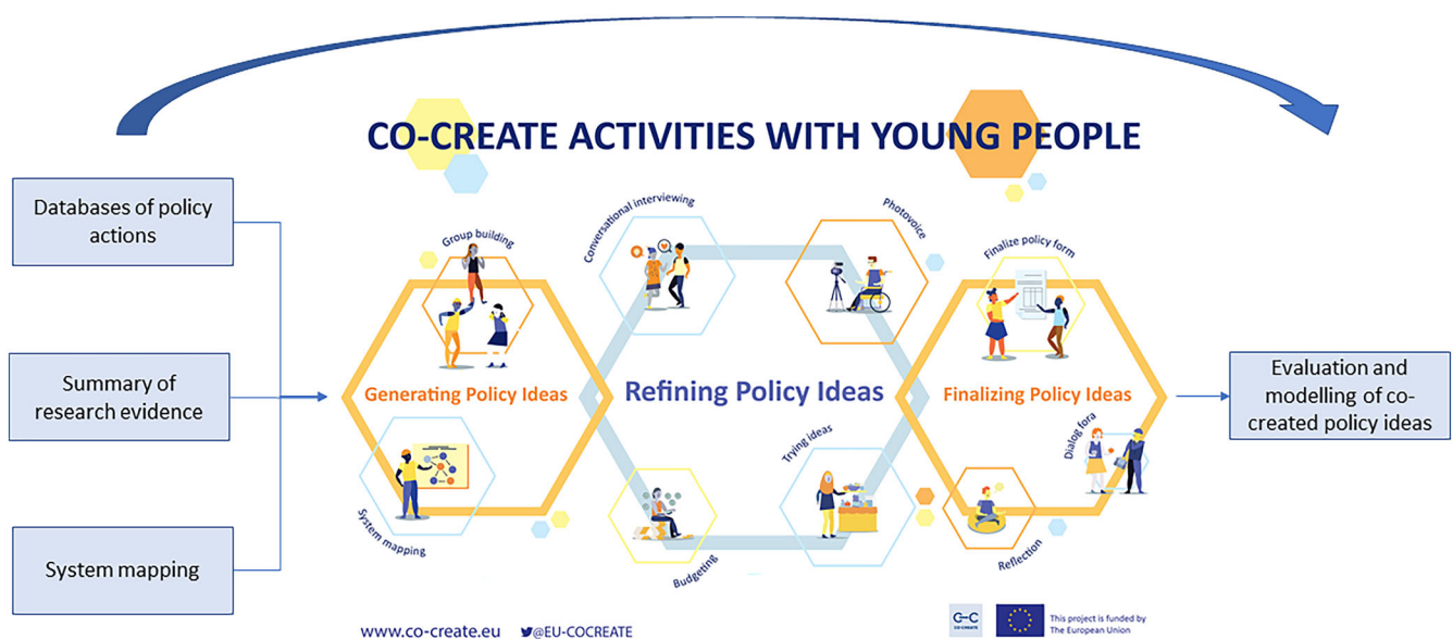
FIGURE 2 The overall flow of the CO-CREATE project and the relation between the two main objectives: Monitoring and youth engagement process

Ensuring that the novel aspects and findings of the CO-CREATE project are disseminated widely has been a key consideration