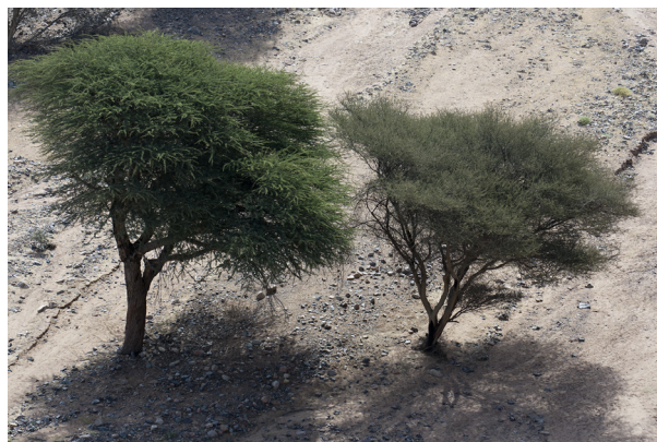
Figure 1. Acacia tortilis (Forssk.) Hayne subsp. raddiana (Savi) Brenan (left) is the dominant of the two subspecies of A. tortilis in the study area; subsp. tortilis is seen to the right.

According to Kyalangalilwa et al. , 2013 the newly formalised official name for Acacia tortilis is Vachellia tortilis (Forssk.) Galasso & Banfi.