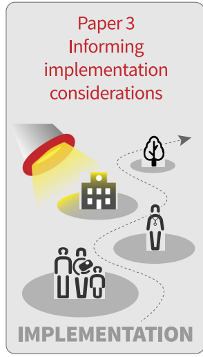
Fig. 1 Overview of the 'Qualitative evidence synthesis in guidelines' series of papers