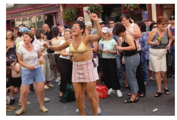
Figure 1. Photo illustrating public intoxication.

the focus groups had 5–7 participants. Due to cancelations, two groups had three participants, but the dynamics in these groups did not differ from the rest (see also Simonen et al., 2017). All groups were gender mixed, except the all-female adult groups in Finland.