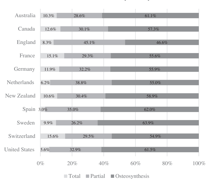
FIGURE A2 Breakdown of type of procedure by country. Total, total hip replacement; Partial, partial hip replacement