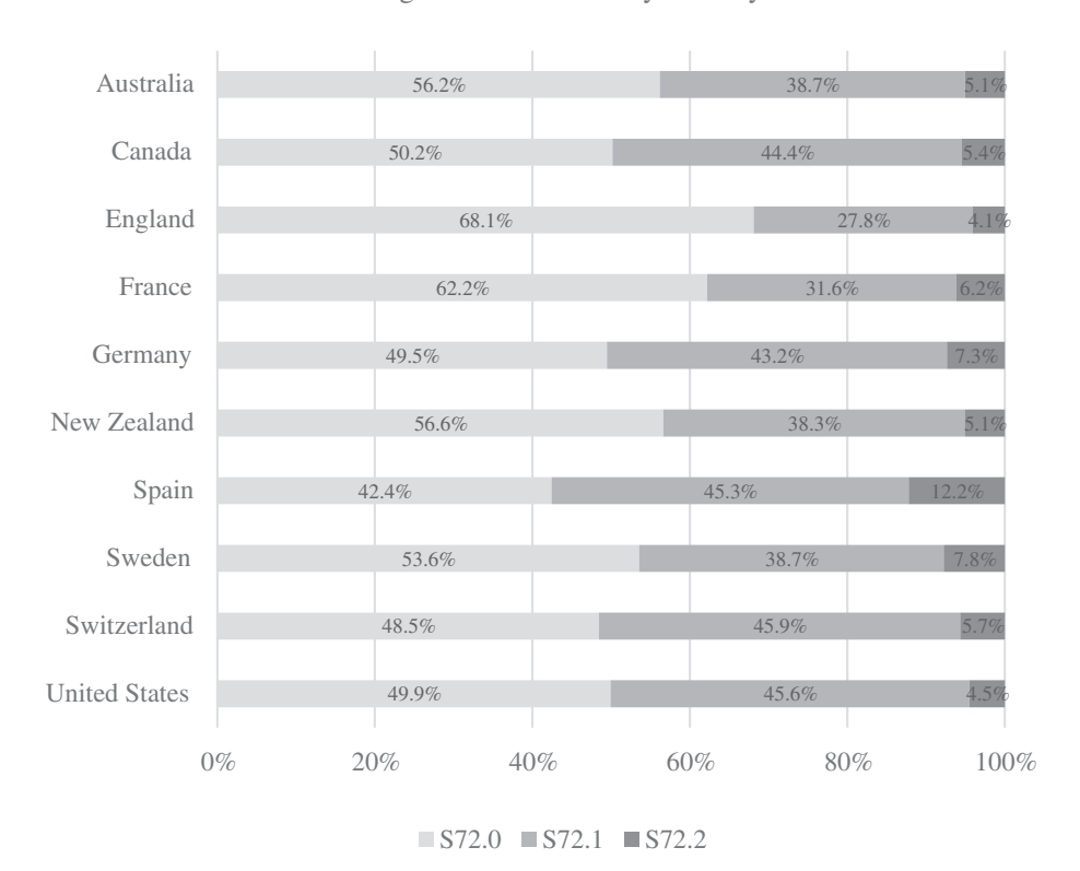
FIGURE A1 Breakdown of hip fracture diagnoses by country. The data used by the Netherlands did not allow for specific breakdown of individual ICD codes. Clinical experts were used to identify relevant codes for fractures of the upper femur. In Spain, there was a crosswalk down from ICD-9 codes to ICD-10 codes with clinical expert input from the country