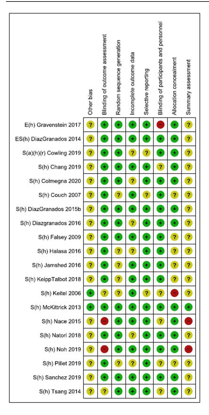
FIGURE 6 Risk of bias summary: review authors' judgements about each risk of bias item for each included study

a significant reduction in laboratory-confirmed influenza B, no significant effect was seen for influenza A(H3N2), with a likely mismatch of the latter to circulating strains. In terms of additional outcomes of interest to this review, the included studies highlight a larger effect with high-dose influenza vaccines compared with standard-dose equivalents for influenza-related hospitalisation, influenza- or pneumonia-related hospitalisation, influenza- related hospital encounters, influenza-related office visits and respiratory-related hospital admissions. Significant caution should be used when interpreting these results in the context of the primary research question given that these studies were typically cohort design and the proxy outcomes are non-specific due to the absence of gold standard