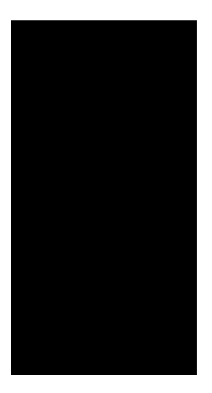
Figure 1 : Individual measurements of serum ionized calcium, parathyroid hormone and 25(OH) vitamin D in 122 participants 10 years after Roux-en-Y gastric bypass. Reference range is marked with lines.