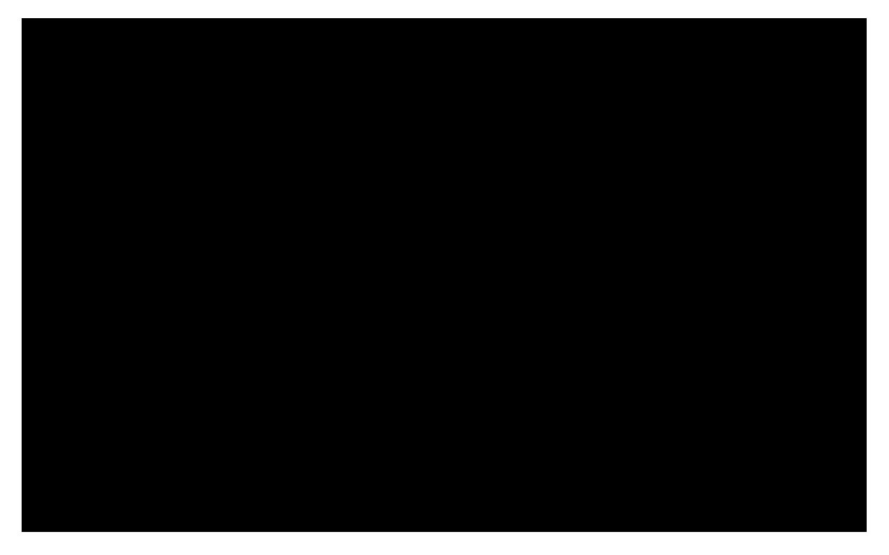
Reference ranges: Carboxyl terminal telopeptide of type 1 collagen (CTX-1), \mu g/L: females 25-49 years: \leq 0.57 , \geq 50 years: \leq 1.01 , males 30-50 years: \leq 0.58 , 51-70 years: \leq 0.7 ; procollagen type 1 N-terminal propeptide (PINP), \mu g/L: females \geq 25 years: 11-94, males \geq 25 years: 20-91; bone specific alkaline phosphatase (BALP), \mu g/L: 5.5-24.6; osteocalcin, nmol/L: females \geq 21 years: 1.5-5.4, males \geq 21 years 1.6-4.3. Missing (n): CTX-1 (4), PINP (5), BALP (7), Osteocalcin (10),

Figure 2 : Individual measurements of bone turnover markers in 122 participants 10 years after Roux-en-Y gastric bypass. Reference range is marked with lines.